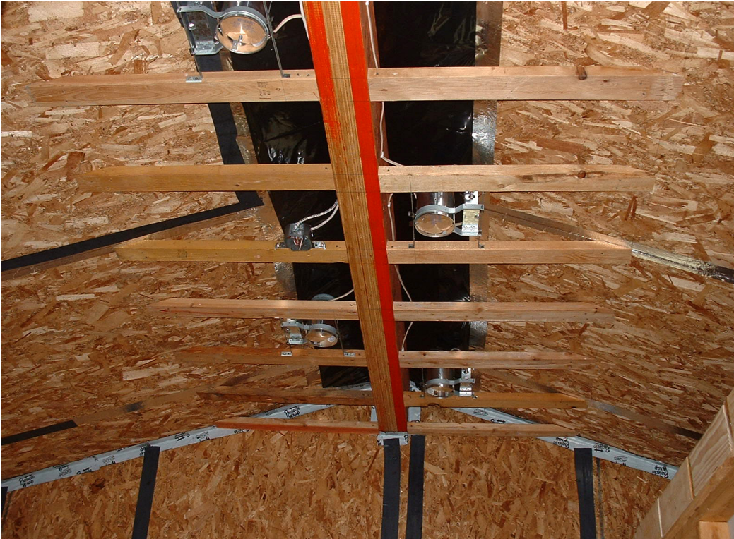
IMAGE 9.9 ALTERNATIVE FURRED-DOWN CEILING