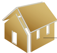
Premier SIPS Building